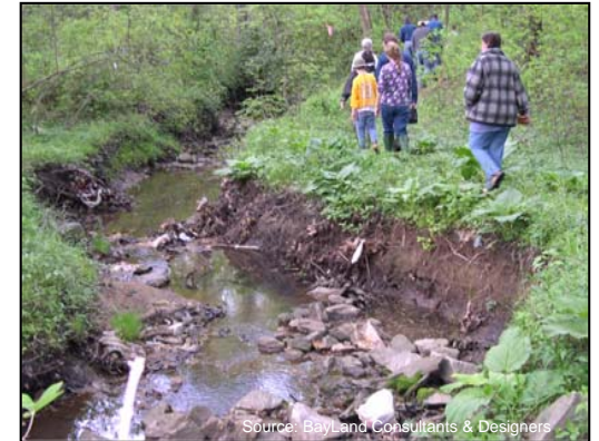
Citizens Discover Effect of Unmanaged Stormwater Runoff