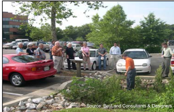
Innovative Stormwater Management Tour for Severna Park Business and Community Groups