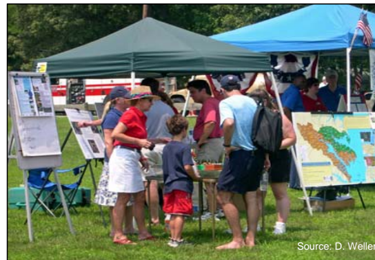
Community Outreach at the Severna Park 4 th of July Festival